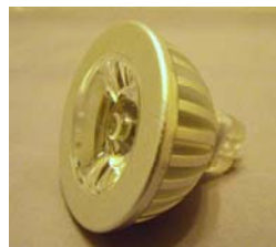
30° beam angle