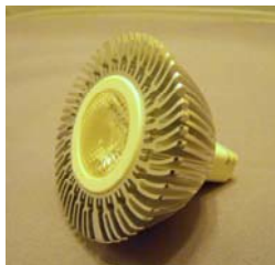
45° beam angle